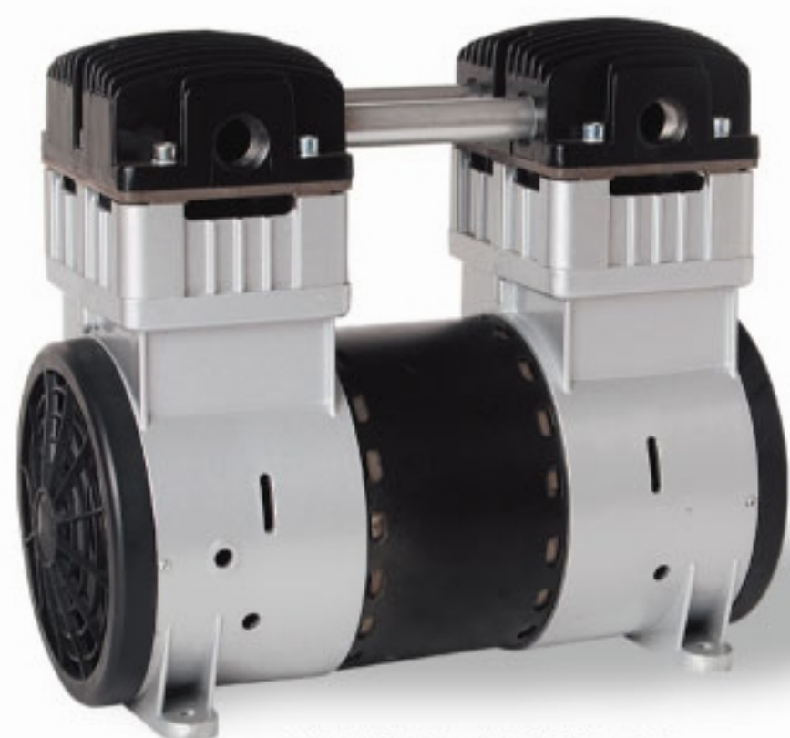
OLF1100 / OLF1500